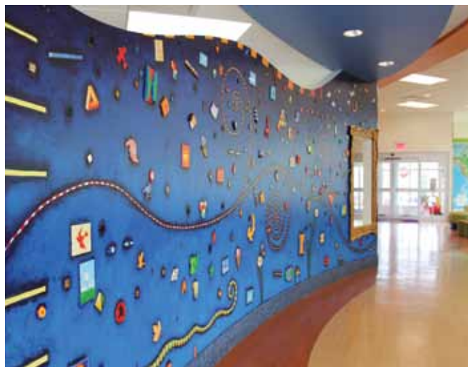
Pictured above: The kid-friendly waiting areas at Kosair Children’s Medical Center – Brownsboro