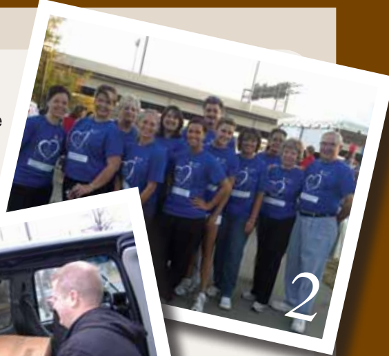
2. L&N Board members and employees at the American Heart Walk.