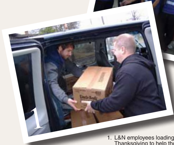
1. L&N employees loading for food this past Thanksgiving to help those less fortunate.