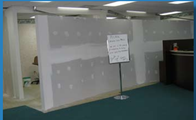
London Branch Remodel