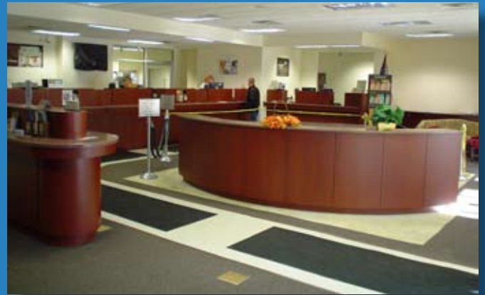
Corbin Branch Remodel

Both renovations should be finished up by December/January.